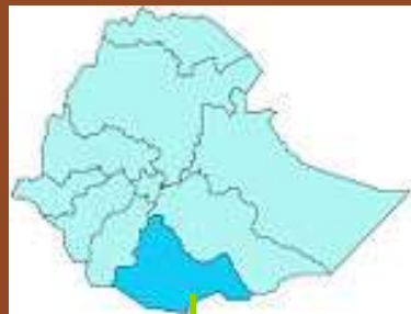
Map of Ethiopia

To bear witness to the love of God (Acts 1:8) by promoting the integral human development of all members of Ethiopian society by ensuring growth and self-reliance through evangelization with the aim of social transformation.