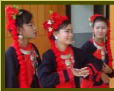
The Adolescents during a program