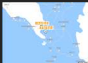
Map of Bereina, PNG

PROJECT 20: Ordinary Subsidy for the Diocese of Bereina, Papua New Guinea.