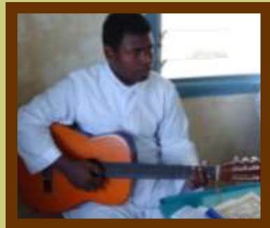
Seminarian from the Solomons

"We really appreciate your kindness. Your gift is a blessing that comes like the manna in the desert in the history of the people of God. The only way to thank you is live well our life and pray that the Almighty Father gives you abundant life in return for your generosity."