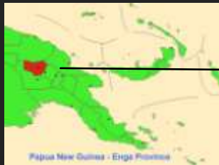
Map of Papua Ne Guinea