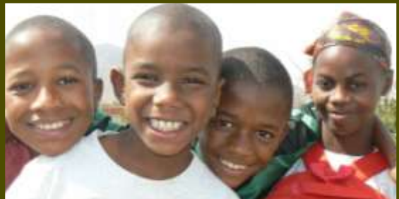
Children from Awasa, Sidamo, Ethiopia poses with grateful smiles. They are among the beneficiaries of our Mission Collection that has been given this year 2014.

“Your gift to MISSIONZ is like a mustard seed. It may be the smallest of all seeds, but when planted, it grows into a big bush where even the birds of the air can take shelter.”