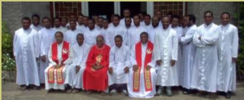
The seminarians of Holy Spirit Seminary in Bomana, Papua New Guinea together with the Bishop and priests in charged of their formation.

The MISSIO Society that works to support in the formation of seminarians and religious