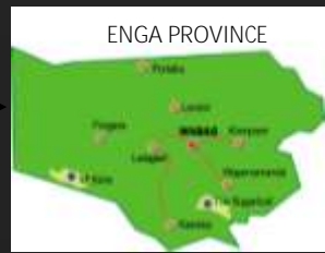
Map of Enga Province, Wabag is Capital City

PROJECT 24: ORDINARY SUBSIDY $ 39,285.00 requested