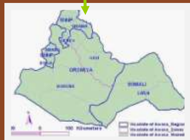
Map of the Vicariate of Awasa