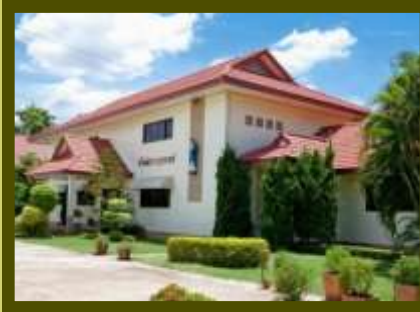
Ban Mae Marie