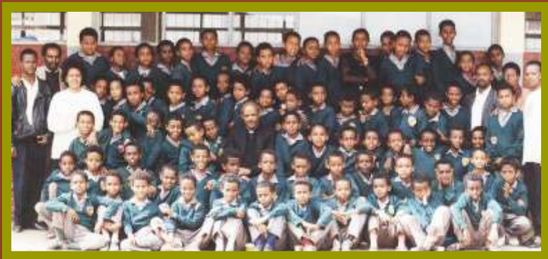
A class from Lideta Catholic Cathedral School in Addis Abeba, Ethiopia