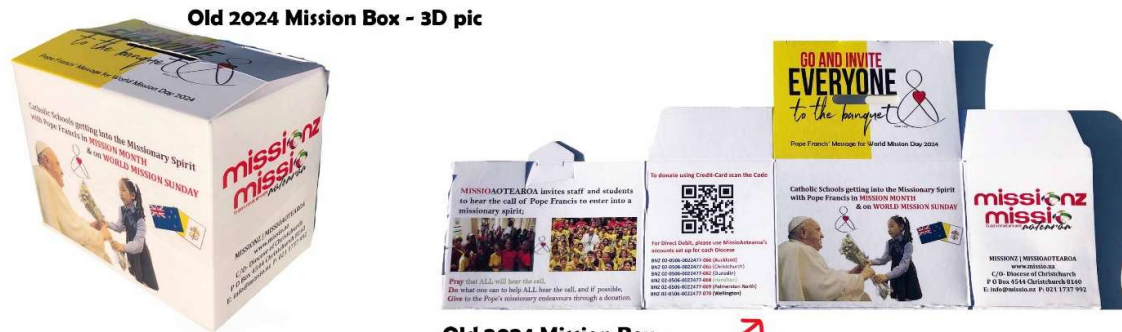
Old 2024 Mission Box → 'opened' out to show panels